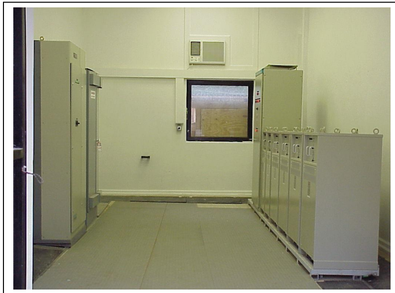
Regulators and Control Cabinet

Purchaser: Brown & Root Services, USA End user: Government of USA